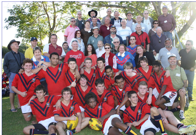
CCC Firsts after playing against All Souls with proud Past Students, Saturday 9 June 2012

The final event for the weekend was brunch which was held in the Columcille Gardens. Past Students sat around for hours getting in a final story or twenty. Many have remarked that they have pencilled in 2017 to return for the next reunion.